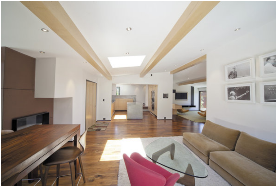
An open great room makes the home feel larger than its 2,000 square feet.

Share | Tweet 27 | Recommend 5 | Text size